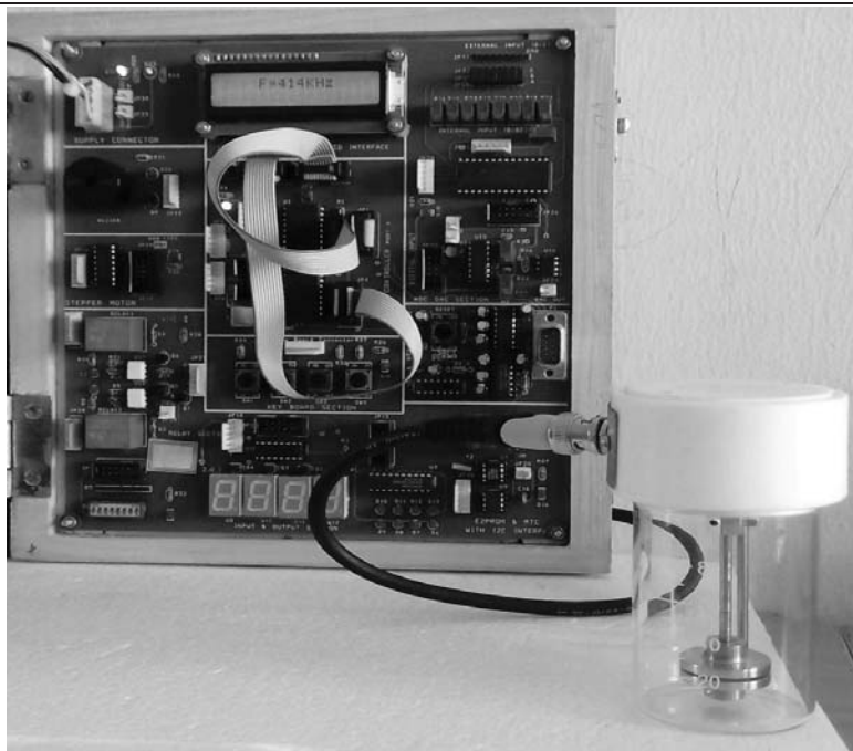
Fig. 3. The Experimental Setup of developed system

and LCD to the microcontroller system. The essential softwares are programmed and execute on personal computer with the help of keil compiler. The executed programme put into microcontroller IC by interfacing to the personal computer.