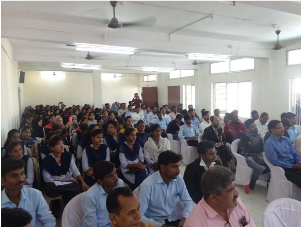
Participants listening to speaker.