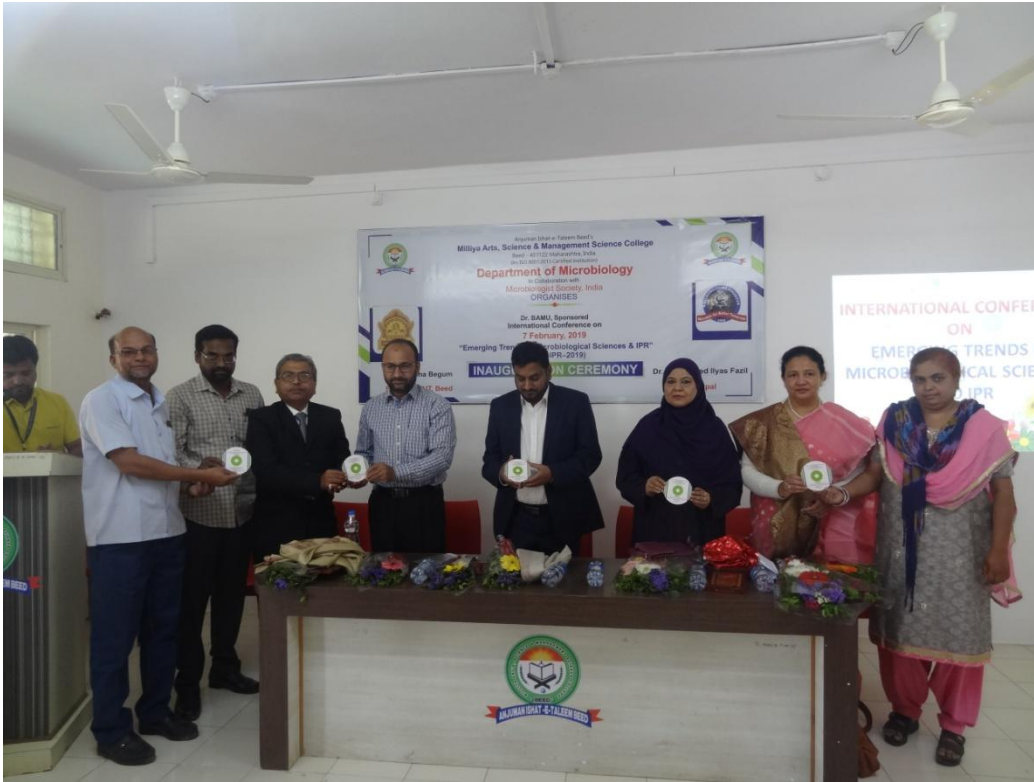
Publication of CDs of Souvenir of the conference.