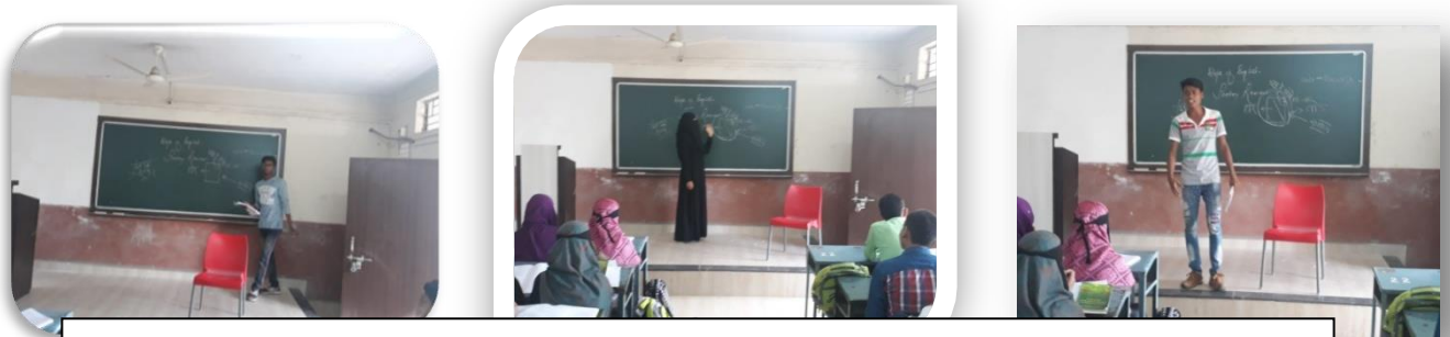
Student readers participating in the Poetry Reviewing Activity 25 -09-2019