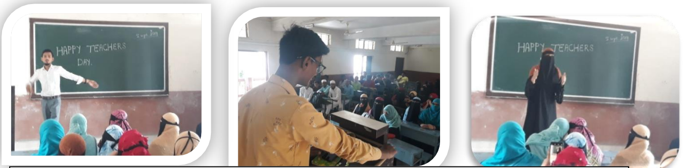
Student readers expressing their thoughts in the Teachers Day Celebration 5th Sep., 2019